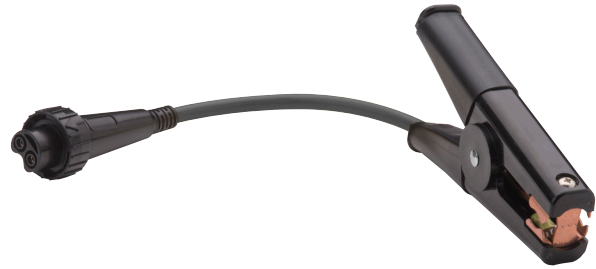
KC1-C Kelvin Clip 1 - connect Order part number: 1006-447