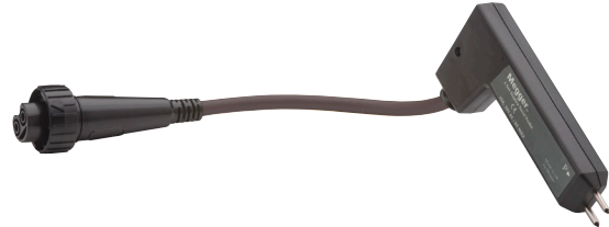
DTP1-C Duplex Twist Probe 1 - Connect Order part number: 1006-449