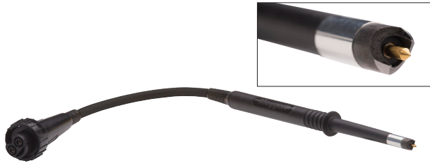
CP1-C Concentric Probe 1 - connect Order part number: 1006-448