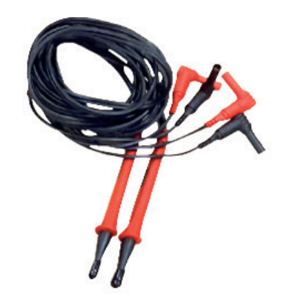
6 ft CAT IV 300 V rated compact kelvin probes, 4 mm shrouded plugs

6 ft CAT IV 300 V rated compact kelvin clips, 4 mm shrouded plugs