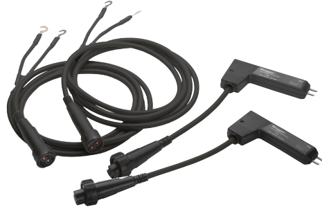
3M Duplex Handspike lead set, with connect (x2) Order part number: 1006-442