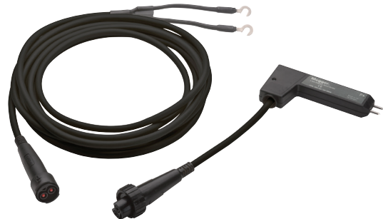
6m / 20' version of DH1-C above but only 1 included Order part number: 1006-443