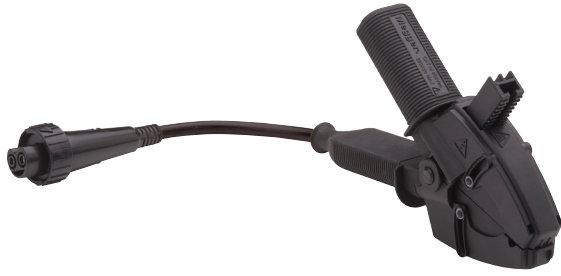
KC2-C Kelvin Clip 2 - connect Order part number: 1006-451