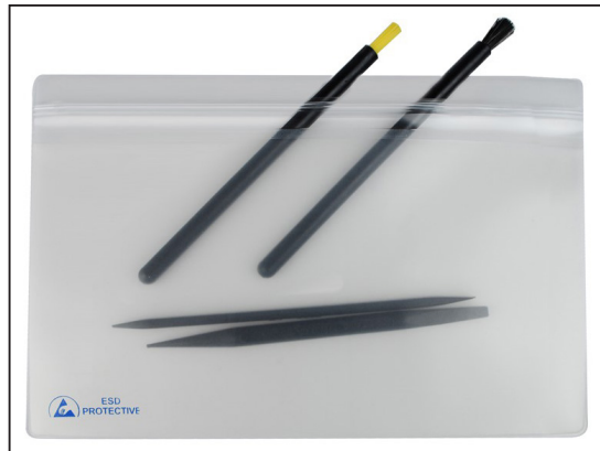
34458 with brush tools and probes (not included)

"It should be understood that any object, item, material or person could be a source of static electricity in the work environment. Removal of unnecessary nonconductors, replacing nonconductive materials with dissipative or conductive materials and grounding all conductors are the principle methods of controlling static electricity in the workplace, regardless of the activity." [ESD Handbook ESD TR20.20-2008 section 2.4 Sources of Static Electricity]