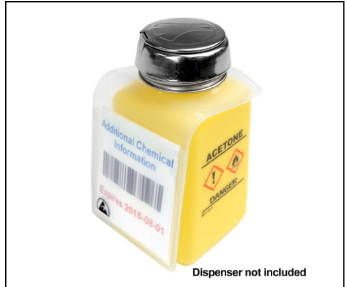
Figure 2. Item 35393 installed on a 6 oz bottle