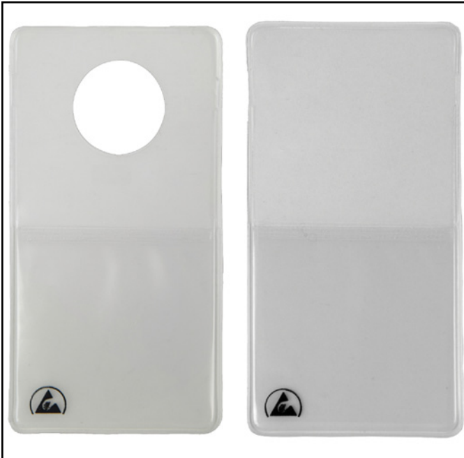
Figure 1. ESD Bottle Hang Tag, 35393 (left) & 35394 (right)