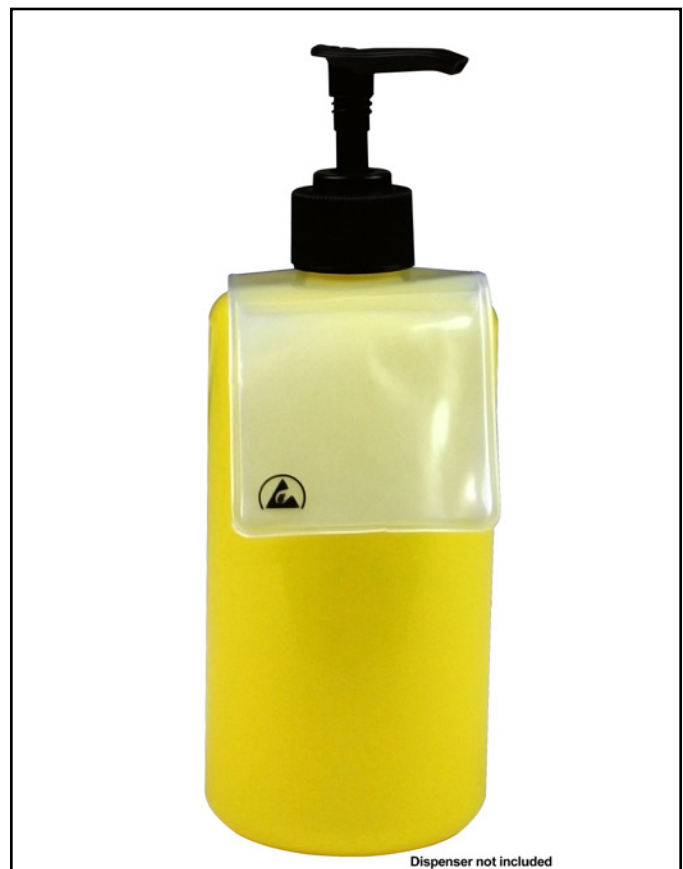
Figure 2. Item 35394 installed on an 8 oz wash bottle