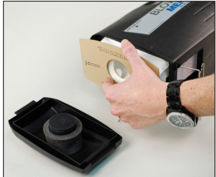
Figure 5: Removing and Changing the Filter