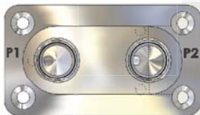
DN or DI Standard Manifold

(AI) Absolute, Isolated 0-17, 0-38, 0-100, 0-1,000 PSIA