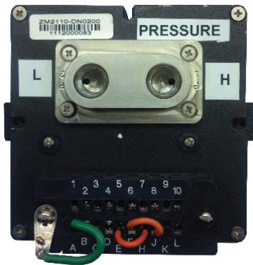
Back of M2110P

Meriam's M2110 Series Smart Gauge is back by popular demand! It features Meriam's new Embedded Pressure Instrument (EPI) for the latest technology while retaining the same enclosure and user interface as the original design. The large display, flexible mounting (Panel, Pipe or Bench top) and power options (24 VDC, Battery or AC) make it the ideal gauge for almost any application. The M2110 features NIST traceable accuracy of \pm 0.05\% F.S., independent of temperature effect, at a very reasonable price.