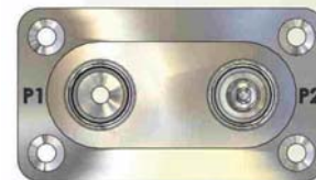
GI, CI, or AI Standard Manifold