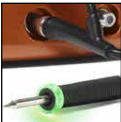
LED equipped hand piece signals to operator when a good solder joint is formed.