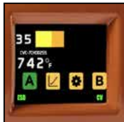
Tip temperature displayed on large color screen.