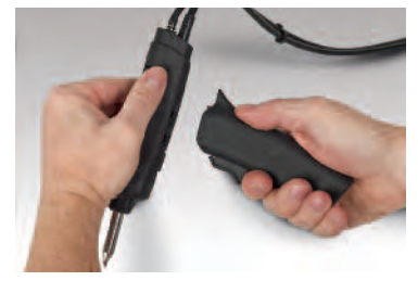
Remove grip for Pencil config.