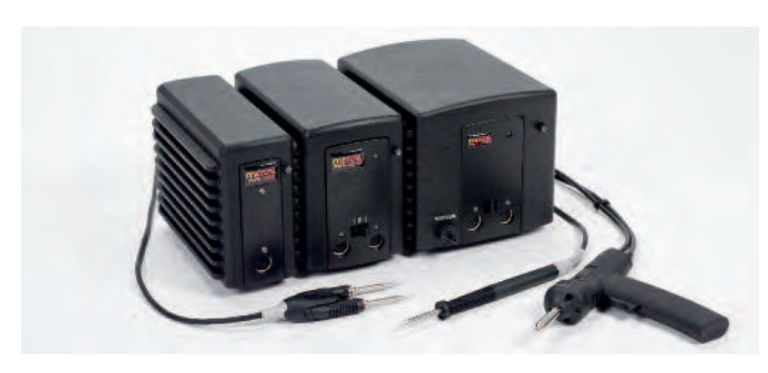
MFR-2200, MFR-1100 and MFR-1300 series (shown on page 14)