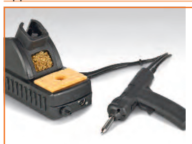
MFR-UK5 Upgrade Kit Compatible with all MFR Series Power Supplies