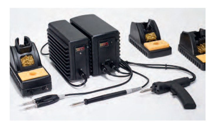
MFR-2200 and MFR-1100 series