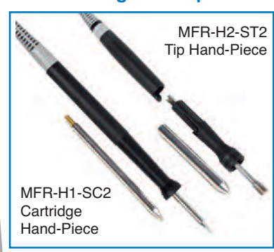
Slimmer grip for added comfort and handling.