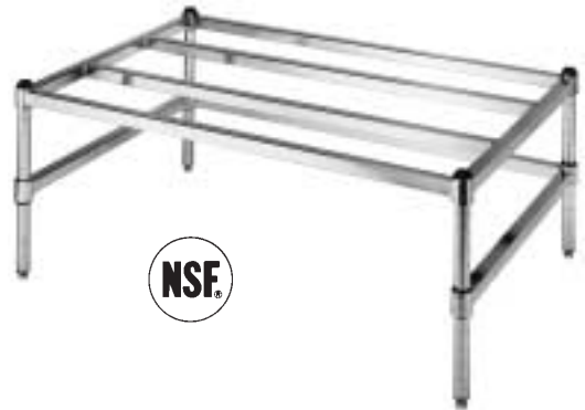
Stationary Dunnage Racks Without Mat