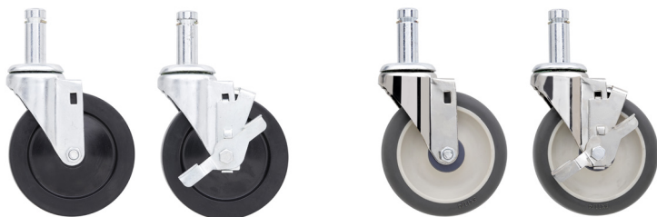
Resilient Rubber Casters

Note: The post used on the carts is model number 63UP.