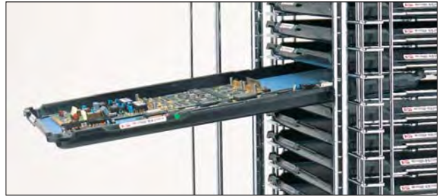
SmartTray™ engages with wire cart design to provide optimum ergonomic access.