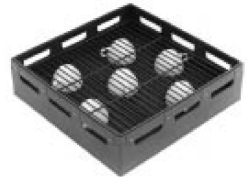
G2020 Grid in full-size rack