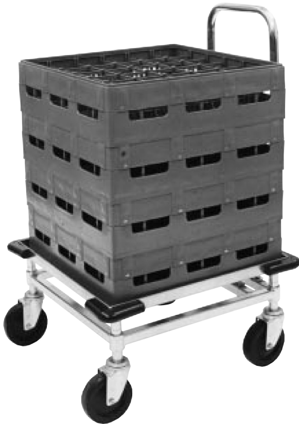
Model CBH2121C (with Sani-Stack Racks)