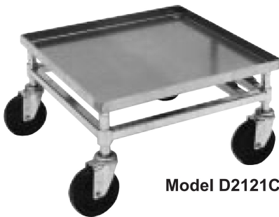
Heavy-Duty Cup/Glass Rack Dollies