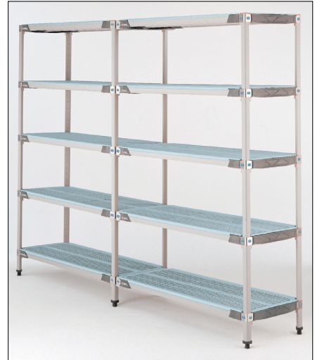
Add-On units with “S” hooks can only be attached to shelves supported by two or more posts.