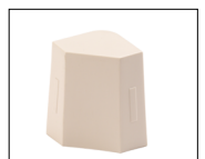
Corner adapter (plug) fits MetroMax i

Required when joining units at right angles with open corner and no post. Intermediate bracket connects a shelf corner to the front beam of the adjoining shelf. Kit includes one intermediate bracket, two “S” Hooks, and two corner adapter plugs. One required per storage level. Cat. No. MX9996