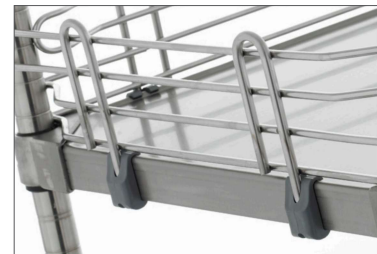
Stainless ledge with polymer clip