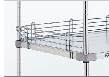
Chrome ledges with plated steel clips