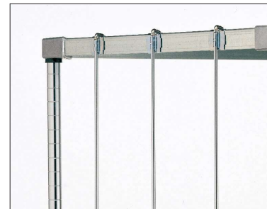
Additional plated mounting spring clips: Cat. No. 9184Z, bag of 6.