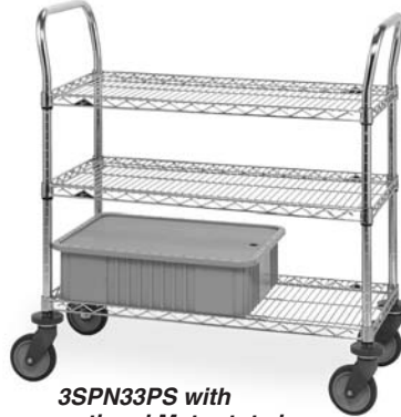
3SPN33PS with optional Metro tote box