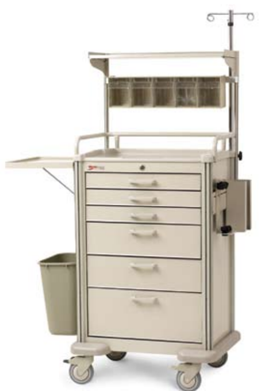
MBP3210TL, MB-LT (Light Taupe) with Accessory Package MBPANES-2