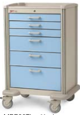
MBP30TL with drawers