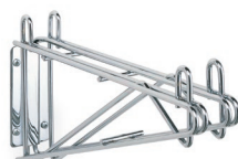
Double Shelf Support