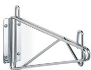
Single Shelf Support

Note: User should determine that wall material and method of mounting are suitable to support the shelves and their contents.