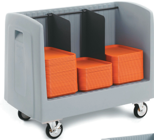
Model SSD16 Shown above with Optional Divider Accessory A110