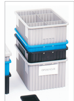
Tote Boxes (shown with Cardholder)

*Items must be purchased in carton quantities to avoid a broken lot charge. Pricing based on quantity ordered. Please consult your Metro representative.