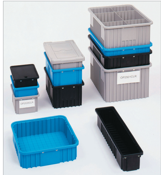
Metro Divider Boxes

All Metro Catalog Sheets are available on our website: www.metro.com