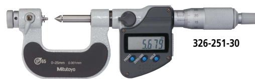
Interchangeable anvils/spindle tips (optional)