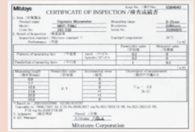
Certificate of inspection provided for 0-1" and 1-2" models only.