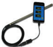
Temperature/ Humidity Sensors