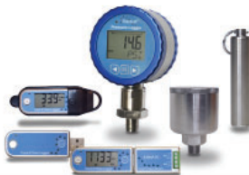
Track-It™ Data Loggers