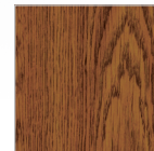
10 - Oak