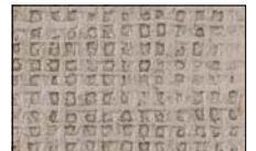
Gray Vinyl 44