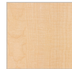
Fusion Maple + Black Edgeband