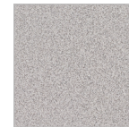
Gray Nebula + Black Edgeband