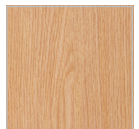
Castle Oak + Black Edgeband