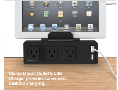
Clamp Mount Outlet & USB Charger provides convenient desktop charging.