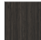
Asian Night + Black Edgeband