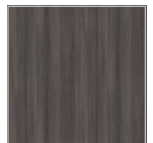
Low Line + Black Edgeband