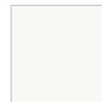
Whiteboard + Black Edgeband