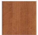
Amber Cherry + Black Edgeband