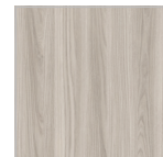
Gray Elm + Black Edgeband