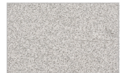
GN - Gray Nebula