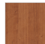
Amber Cherry + Black Edgeband