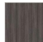
Low Line + Black Edgeband