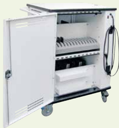
Soft, durable optional Foam Organizer (55486) cradles phones and/or small tablets while charging