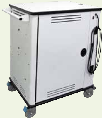
55480 eVolve Cart

55480 WFCW base cart (see chart below for all of the eVolve cart product and option numbers)