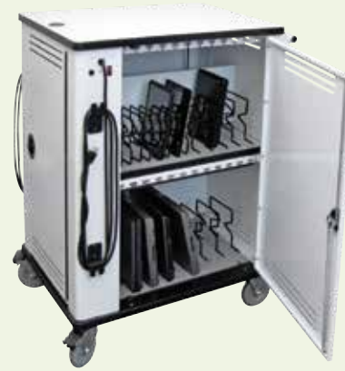
The image above displays the ingenuity designed into the eVolve™ Cart. Carts can be outfitted with optional Wire kits (55485). Kits are designed to support multiple devices.