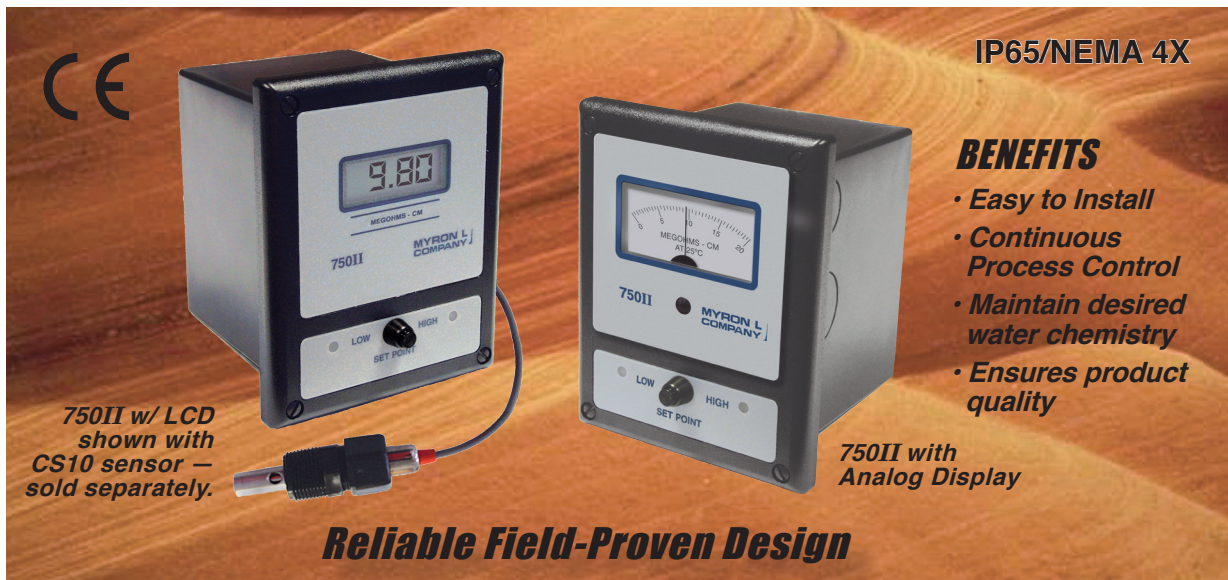
750II w/ LCD shown with CS10 sensor — sold separately.