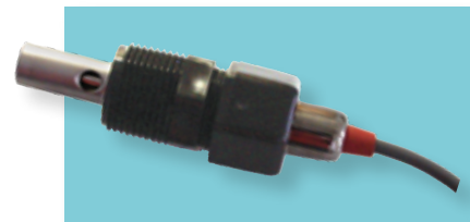
Assembled Resistivity Sensor

The CS10 was designed primarily for use in pure water applications.