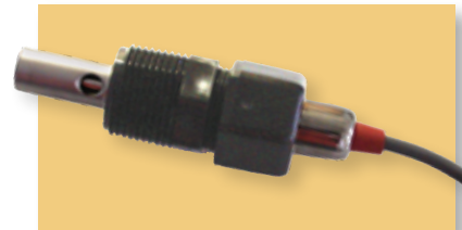
Assembled Conductivity Sensor

The CS51 is ideal for general purpose use up to 20,000 \mu S/ppm.