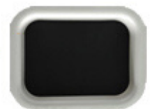
Plastic Drip Trays