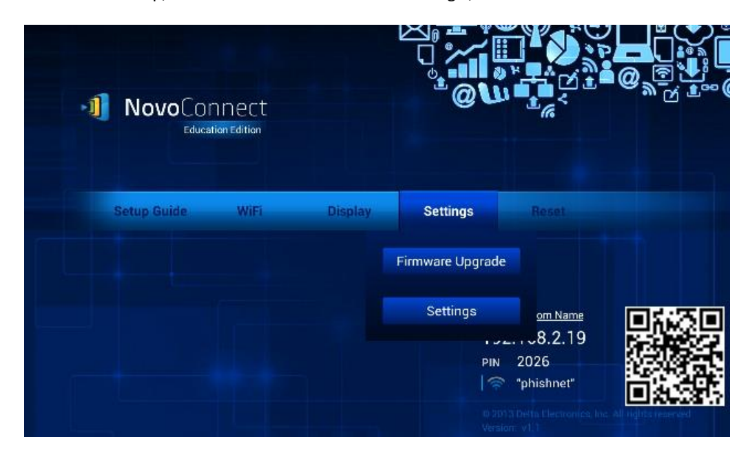
Step 3. Click button "Firmware Upgrade" to start the upgrade process.