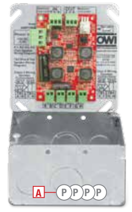
One OWI AMP1SGB Amplifier Can Power One Or Up To FOUR OWI Speakers