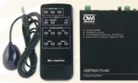
IR Remote Control

PERFECT FOR • CLASSROOMS • SMALL MEETING ROOMS OR LECTURE HALLS • RESTAURANTS AND BARS