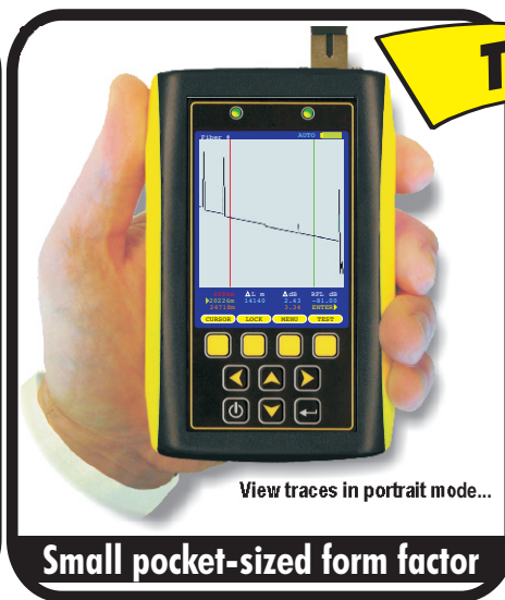
Small pocket-sized form factor