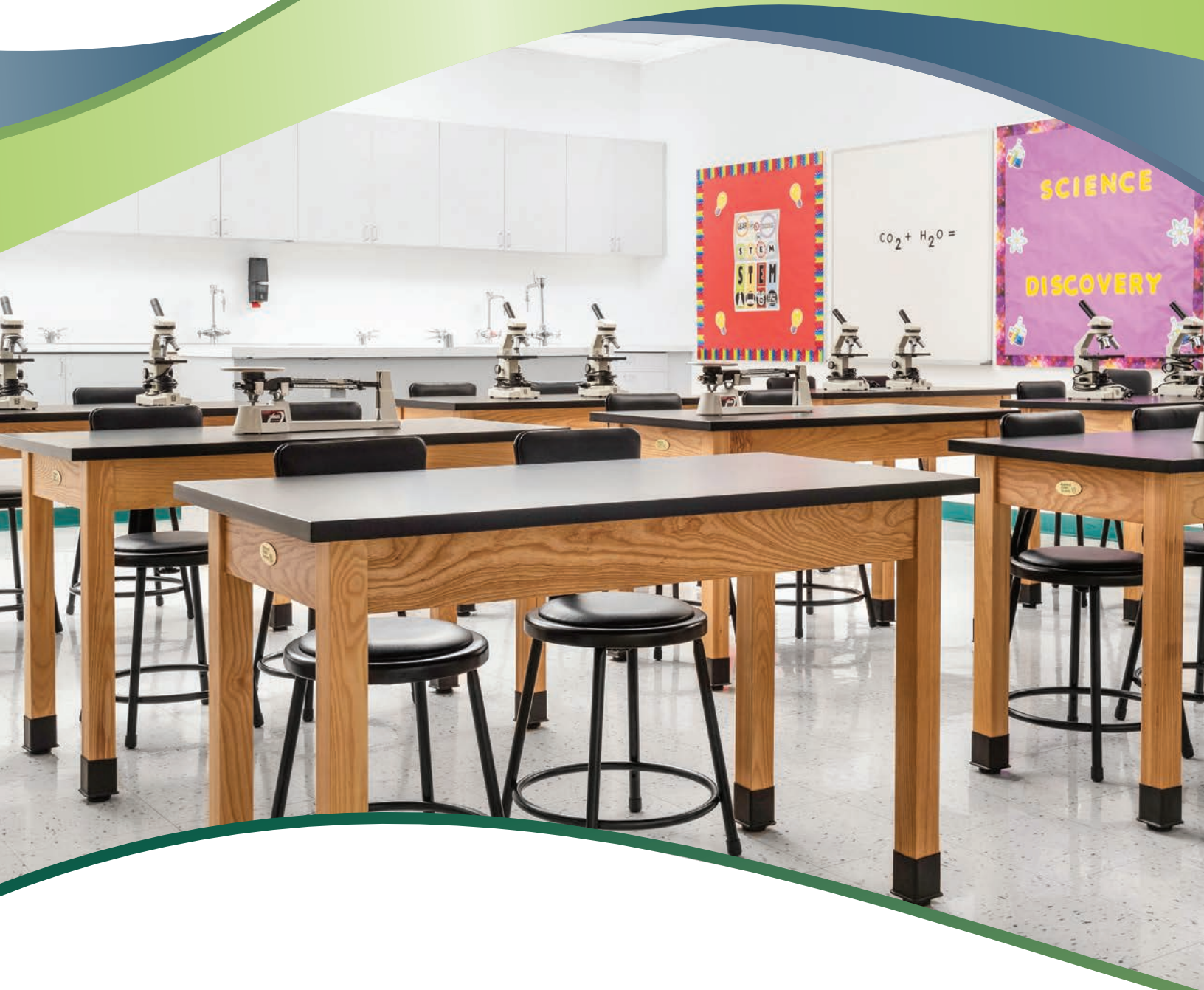
Wood Tables Series

Full line of science tables made for the most rugged environments.