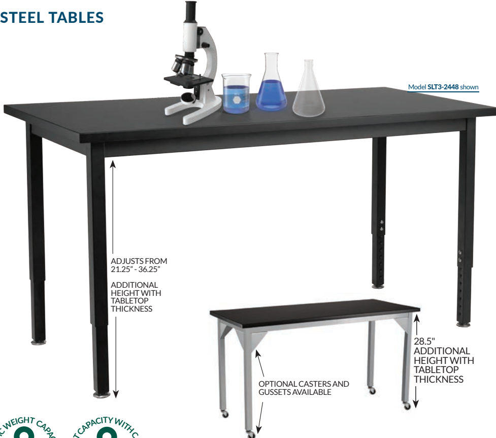
Model SLT3-2448 shown

ADJUSTS FROM 21.25" - 36.25" ADDITIONAL HEIGHT WITH TABLETOP THICKNESS