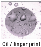
Oil / finger print