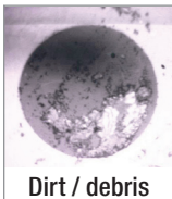
Dirt / debris