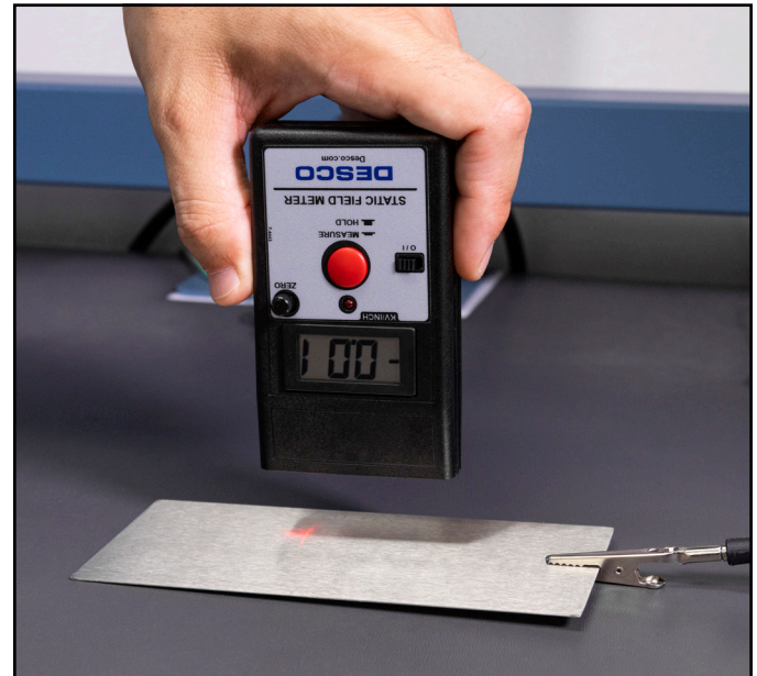
Figure 6. Pointing the Digital Static Field Meter to a grounded surface

Slide the power switch to the right to power the Digital Static Field Meter. Point the top of the Digital Static Field Meter approximately 1 inch (2.5 cm) away from a grounded metal surface. Proper spacing is indicated when the two red bullseyes emitted LED range indicator become centered on top of each other. Turn the rotary zero knob until the Digital Static Field Meter's display reads 0.00.