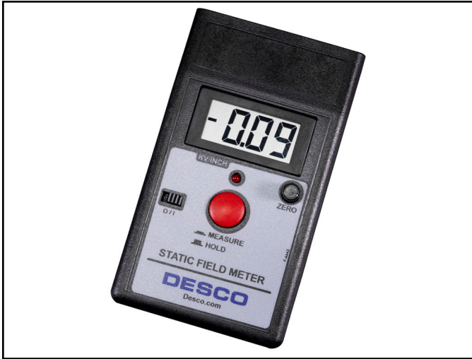
Figure 1. Desco 19442 Digital Static Field Meter