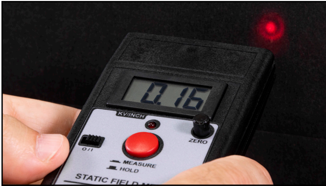
Figure 7. Aligning the two bullseyes emitted by the LED range indicator