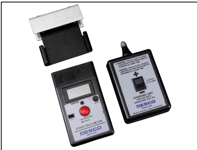
Figure 2. Desco 19443 Air Ionization Test Kit