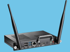
OPS2-i5 | OPS2-i7