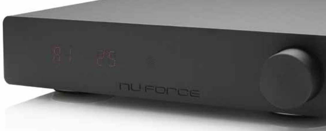
DDA120 + BTR1