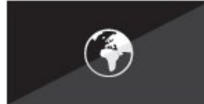
Global monitoring of all AV devices

Multiple ZU650+ can be monitored over LAN and also provide the user with an email message alert in case an error occurs or a light source fails or needs to be replaced, using Crestron RoomView. While the web browser interface and full support for Extron's IP Link, AMX dynamic device discovery and PJ-Link protocols, allow almost all aspects of the ZU650+ to be controlled across a network, keeping you in control, wherever you are.