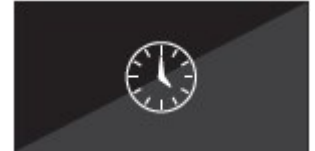
Track projector light source usage