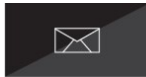
Email alerts and instant notifications - help desk requests, service reminders, device failure or theft