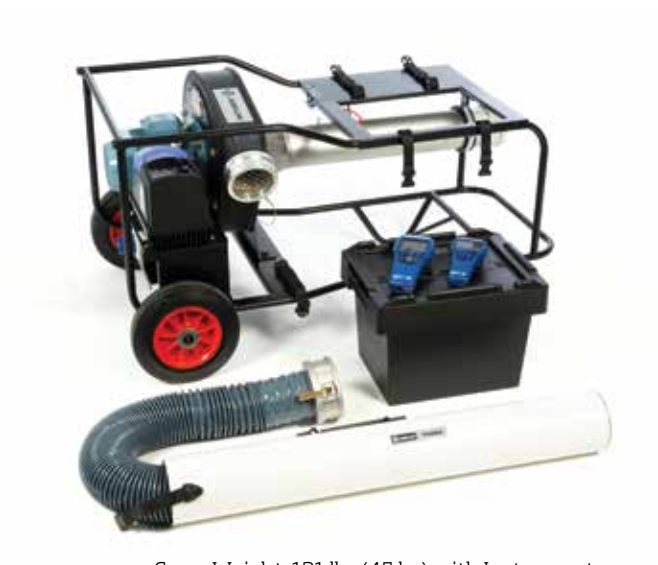
Carry Weight: 121 lbs (45 kg) with Instrument Box and Flex Carrying Tube Removed.