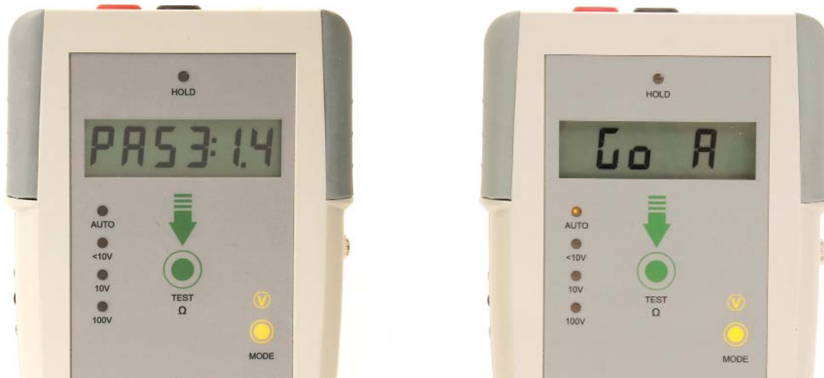
Figure 20: Firmware version