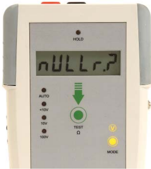
Figure 17: Press MODE to select nULL process