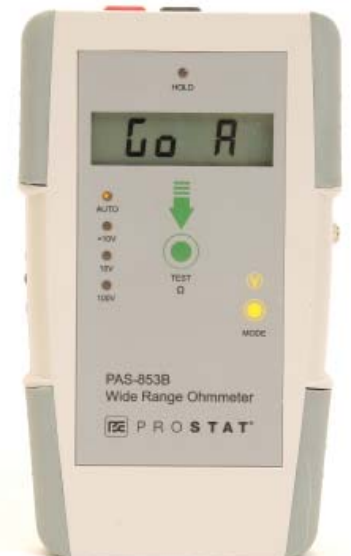
Figure 8: Mode Sequence