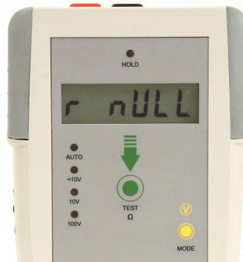
Figure 18: Press TEST and r nULL displays and starts