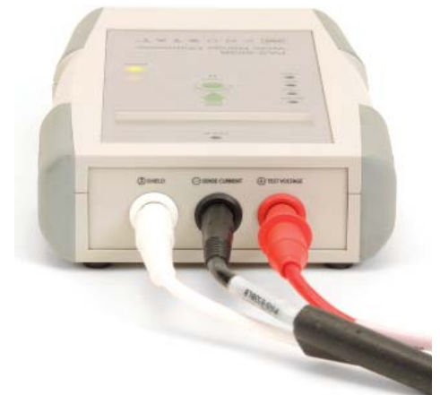
Figure 7: Test Lead Connections: White = Shield Black = Current Sensing Red = Test Voltage