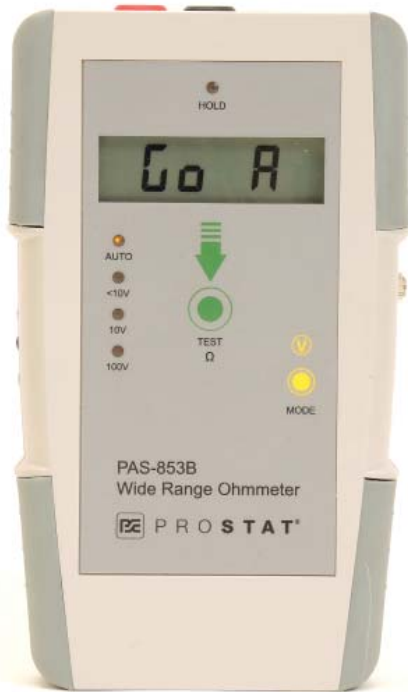
Figure 2: PAS-853B in AUTO - Default Operation Mode