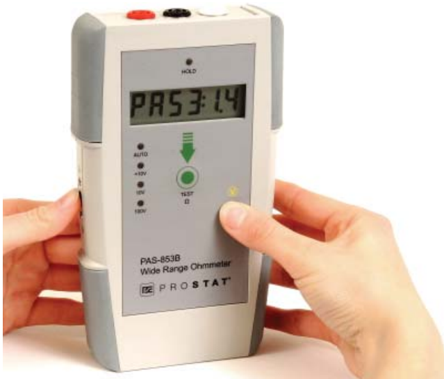
Figure 15: Press and Hold the MODE button while sliding the Main Power to ON.