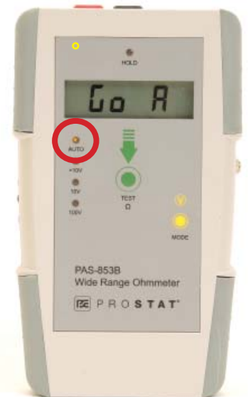
Figure 11: Automatic Mode