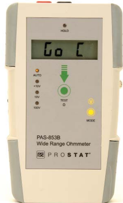
Figure 3: PAS-853B in Continuous Operation Mode