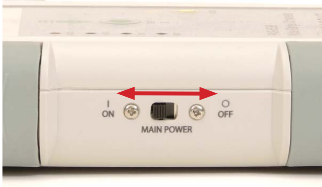
Figure 5: Main Power Battery Cut-Off Switch on side of Instrument