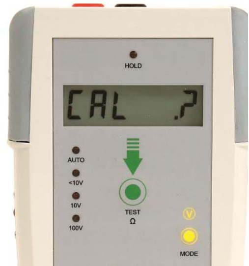
Figure 16: CAL? will be displayed.