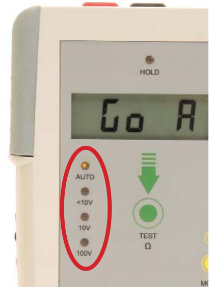
Figure 12: Manual Mode