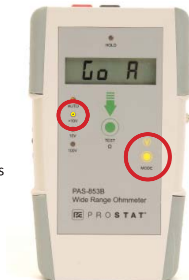
Figure 4: Press MODE to manually Change Test Voltage