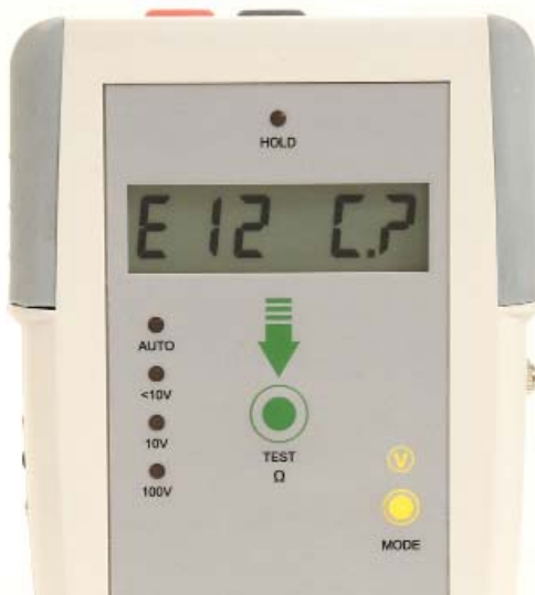
Figure 19: E12 C? and StorE? will display