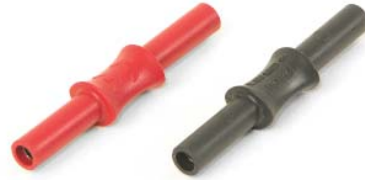
Figure 14: 1 each PAS-853S Test Lead Shunt provided with the instrument.