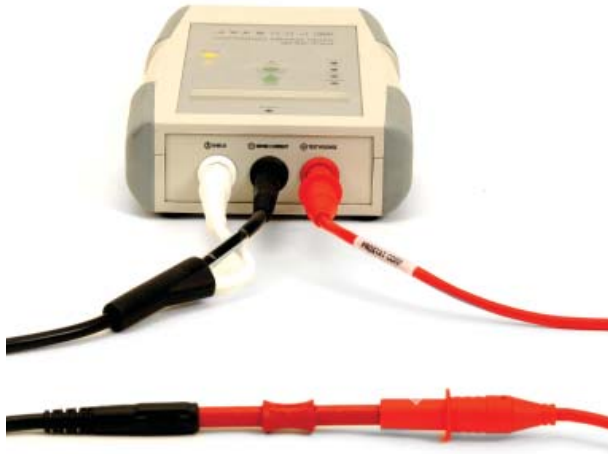
Figure 13: Short the test leads together with the supplied shunt.