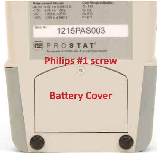
Figure 6: PAS-853B Battery Compartment on bottom of Instrument