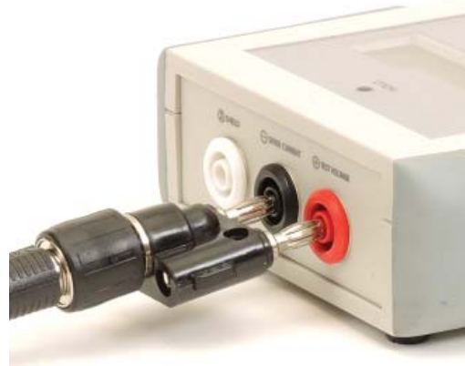
Figure 10: Receptacle spacing accommodates dual banana plug connectors.