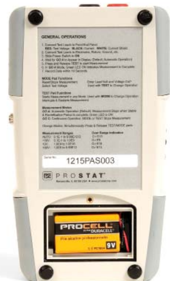
Figure 21: Battery Replacement