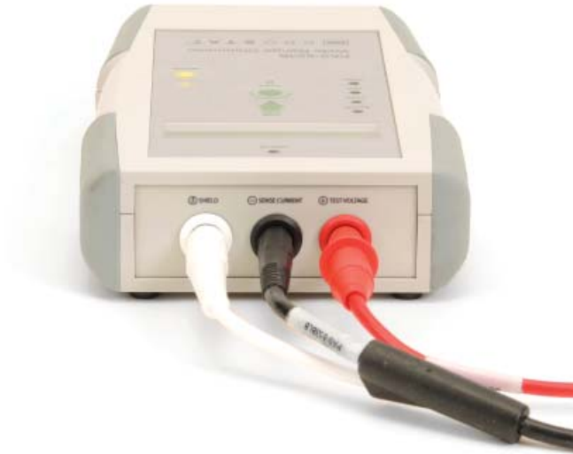
Figure 9: The shield is connected to the meter via the White banana plug and receptacle