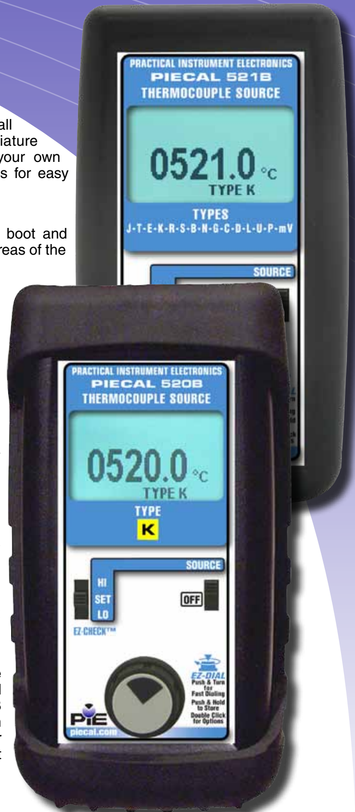
Actual Size (Shown with optional boot)