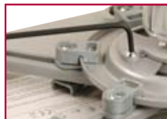
Tamper Resistant Hardware