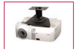
Model Specific Adapters Available