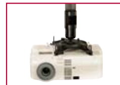
Includes 1 1/2" (38 mm) Internal Cable Management Access Hole