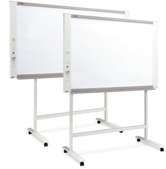
Copyboards shown with optional stands.

The magnetic surface of the board allows you to keep important documents close at hand.