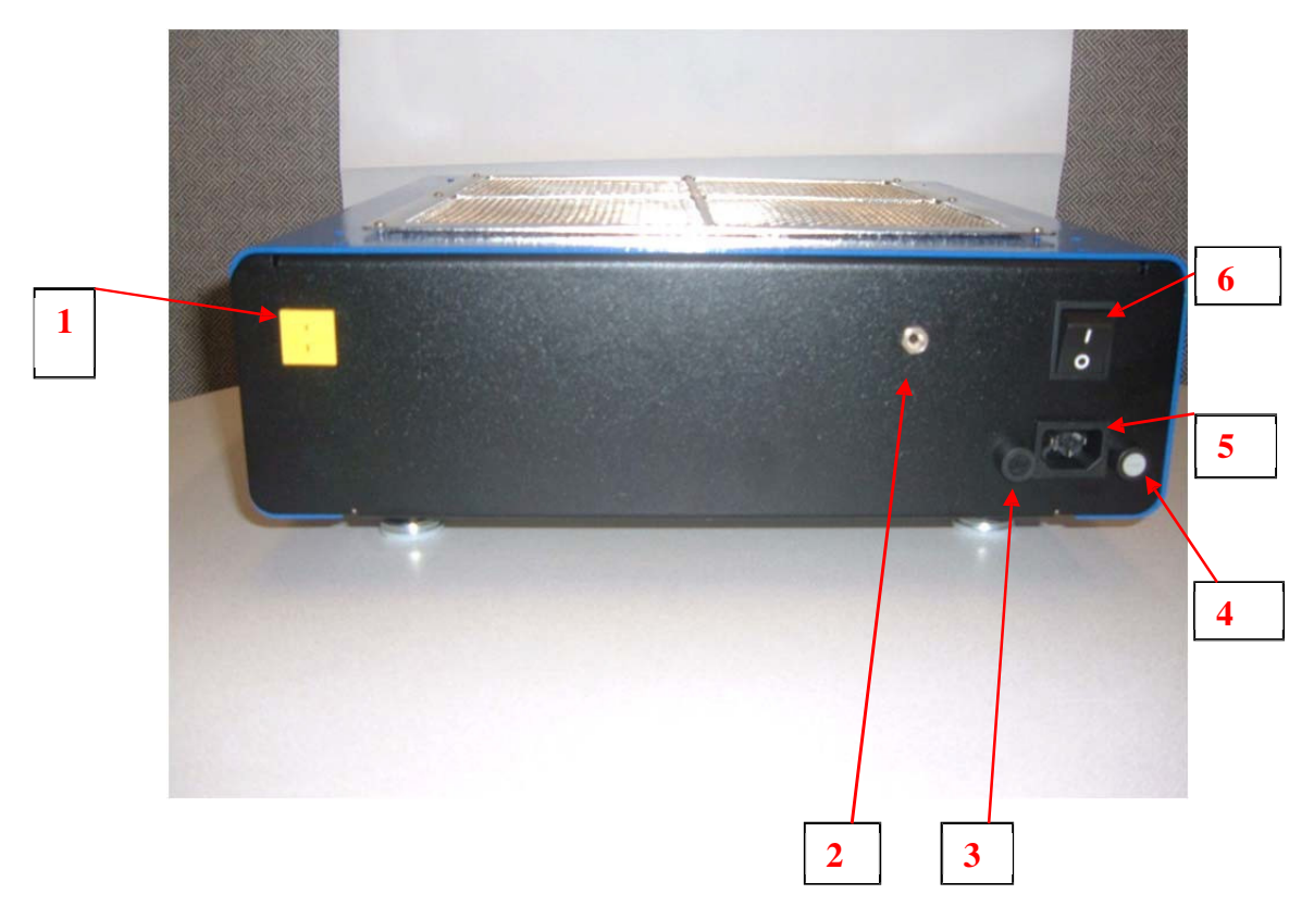
Figure 2 Rear Panel Identification