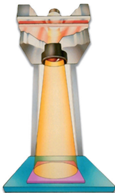
Laser Optical Sensing

By careful design and window sizing, 40,000 particles per ml can be achieved without making the instrument susceptible to counter saturation.