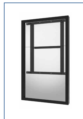
Portrait Orientation Available (EWP-OH85F)